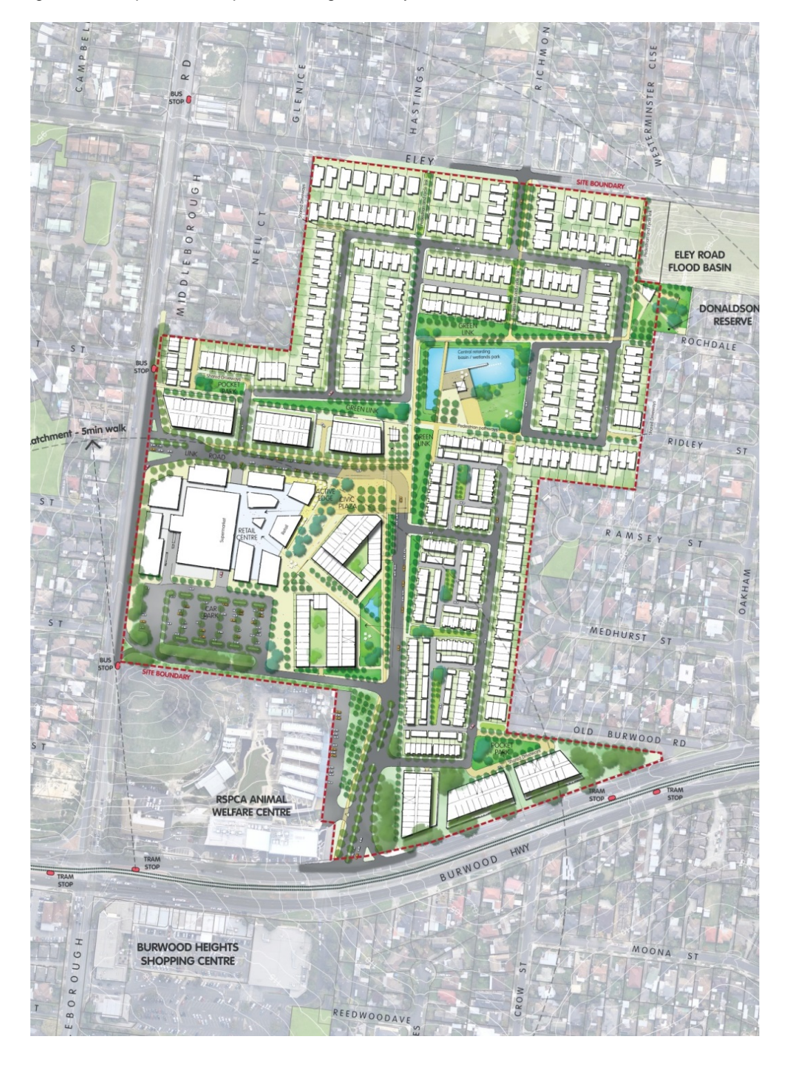
Figure 2 - Adopted Masterplan drawing, January 2015

Frasers' proposal for the 20.5 hectare site includes up to 950 dwellings for approximately 2,000 new residents, a shopping centre with 10,530 square metres of floor space, plus open spaces and public realm improvements. The key Masterplan drawing from the adopted Burwood East Master Plan and Urban Design Report, January 2015 (the Adopted Masterplan) is shown in Figure 2.