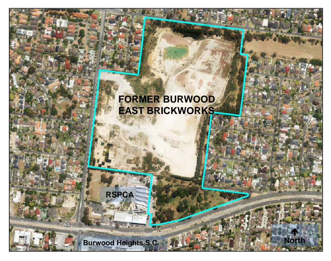
Figure 1 – Former Brickworks Site