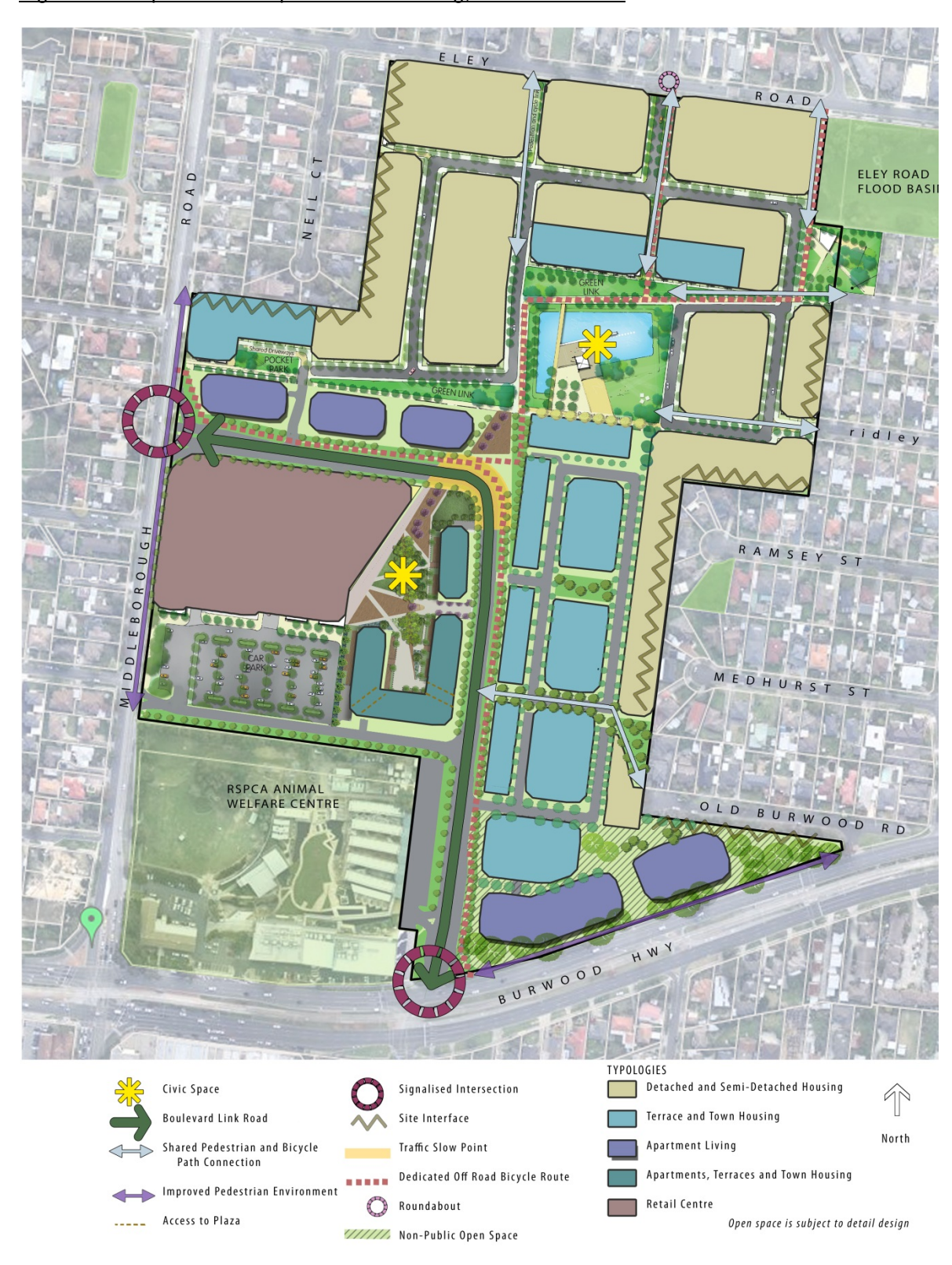
Figure 3 - Proposed Development Plan drawing, December 2015