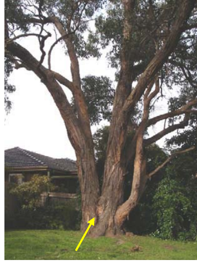
Tree #1 – large base