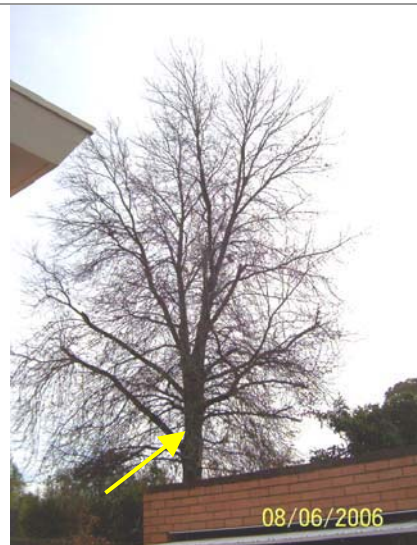
The Pin Oak