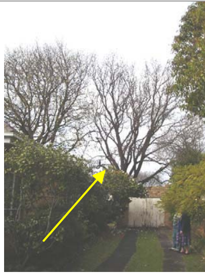
Tree #2 – photo taken from driveway