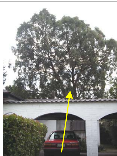
The Yellow Box