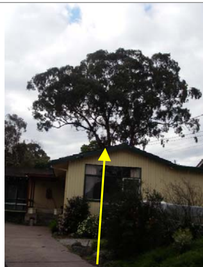
The Yellow Box