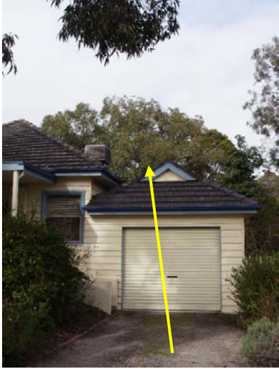
Tree #1 – photo taken from driveway