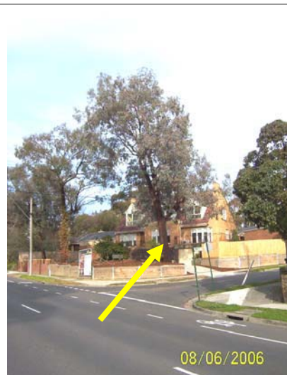
The Red Ironbark