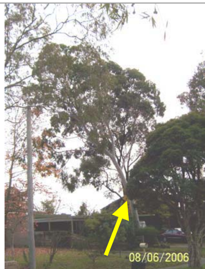
The Lemon-scented Gum