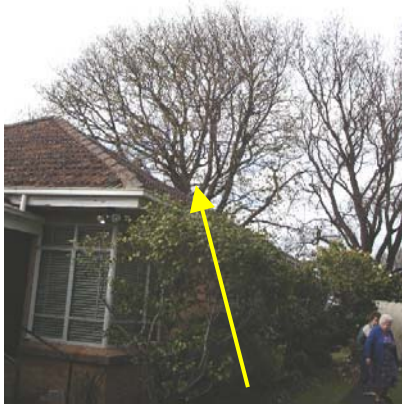
Tree #1 – photo taken from driveway