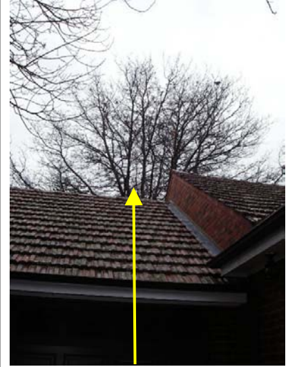
Tree #2 – photo taken from driveway