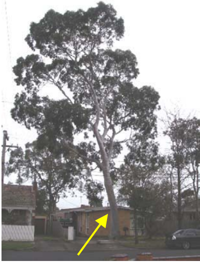
Tree #1 – The Lemon-scented Gum