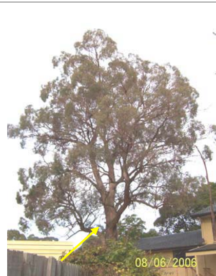
The Narrow-leaved Black Peppermint