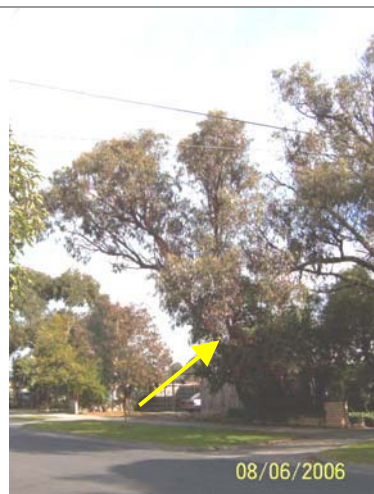
The Silver-leaved Stringybark