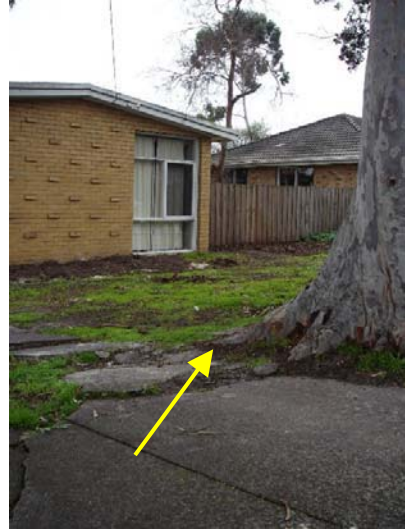
Cracking and lifting of driveway caused by roots of tree #1