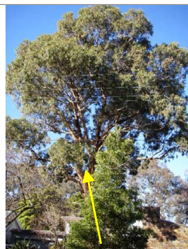
The Yellow Box