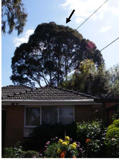
Trees #1 & 2