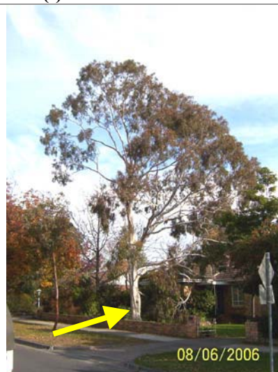
The Lemon-scented Gum