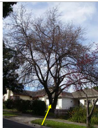
The English Oak