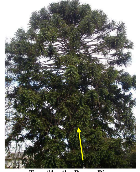
Tree #1 – the Bunya Pine