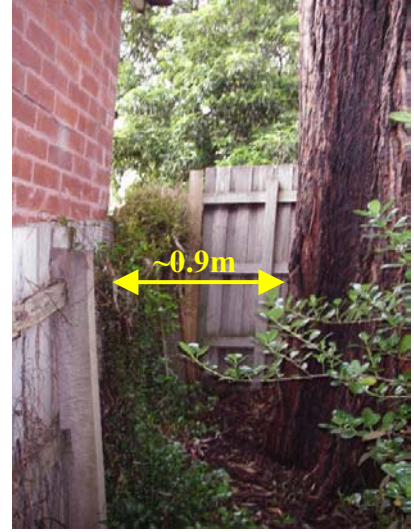
Proximity of base to neighbouring dwelling