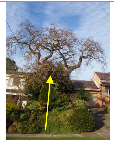
The Grafted Oak