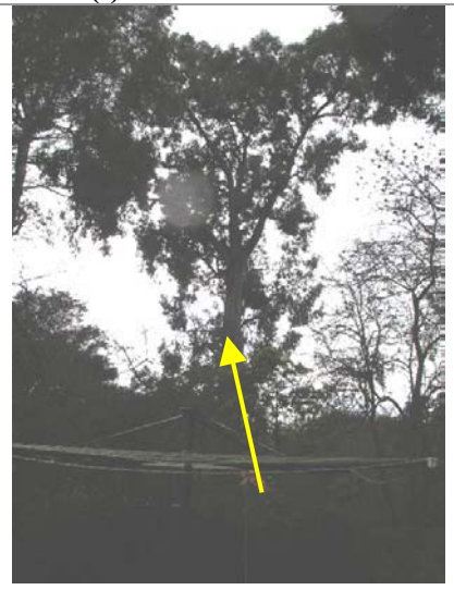
The Red Ironbark