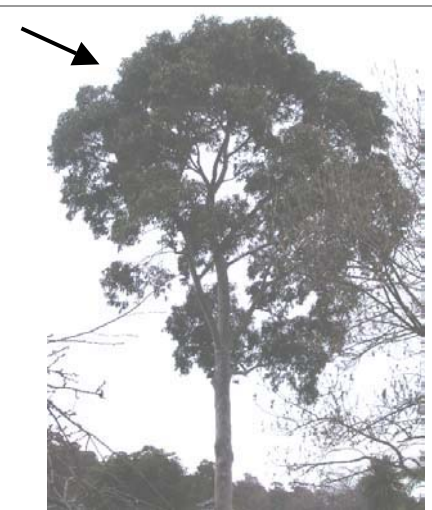
The Spotted Gum