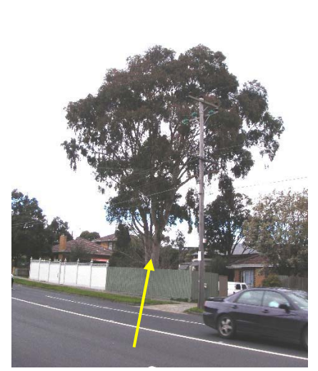
The Lemon-scented Gum