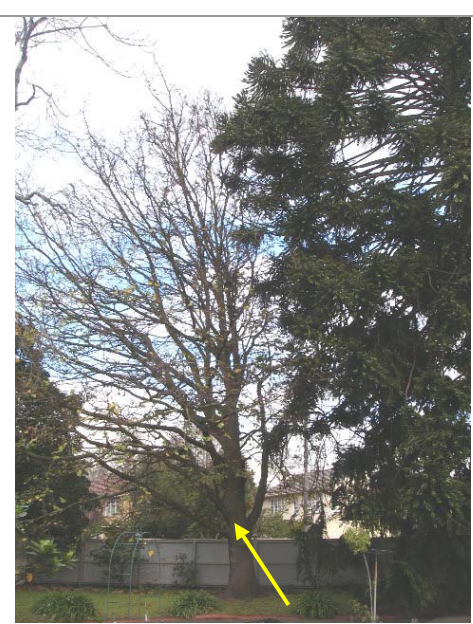
Tree #2 – the Algerian Oak