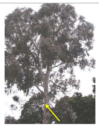
The Red Spotted Gum