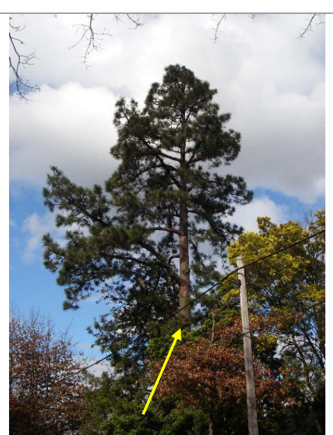
Tree #3 – The Canary Island Pine