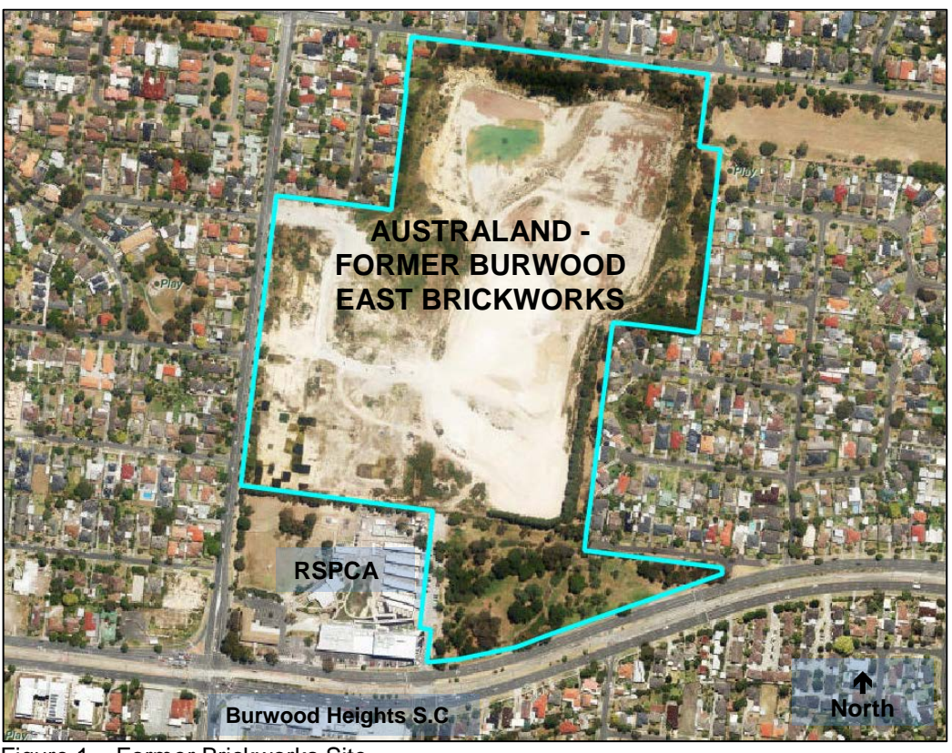
Figure 1 – Former Brickworks Site