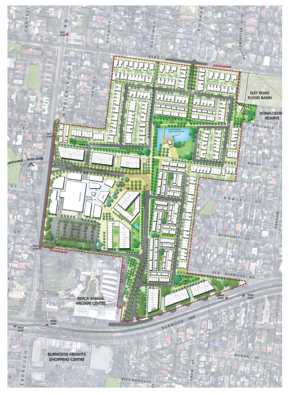
Figure 2 - Draft Masterplan drawing

Subject to relevant approvals being obtained and site remediation, Australand plans to commence in 2015 and to undertake the development in stages over approximately eight (8) years, with completion in 2023. Site remediation to prepare the site for development recommenced in recent months under an existing planning permit and is due to be completed by mid-2015. Primarily the remediation involves addressing contamination, consequent tree removal and filling the land to prepare the site levels.