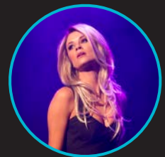
BRITNEY SPEARS: THE CABARET