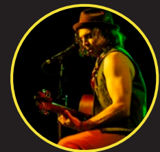
NATHAN CAVALERI: GROWING PAINS TOUR