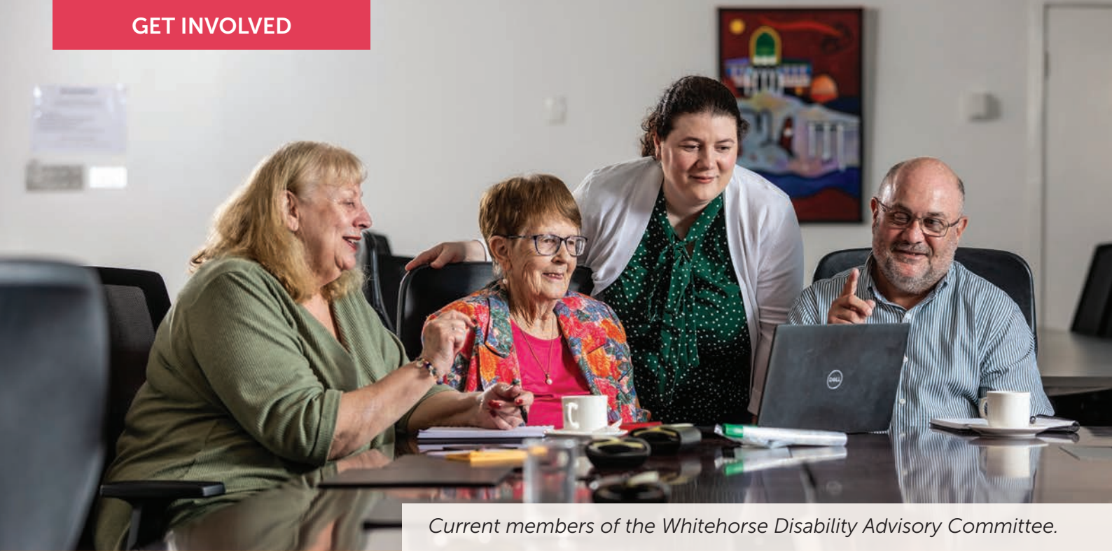
Current members of the Whitehorse Disability Advisory Committee.