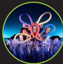
SEA WOLVES HOWL