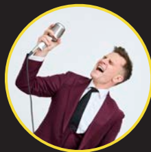
DAVID CAMPBELL: GOOD LOVIN' & MORE