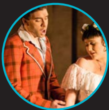
OPERA AUSTRALIA: DON GIOVANNI