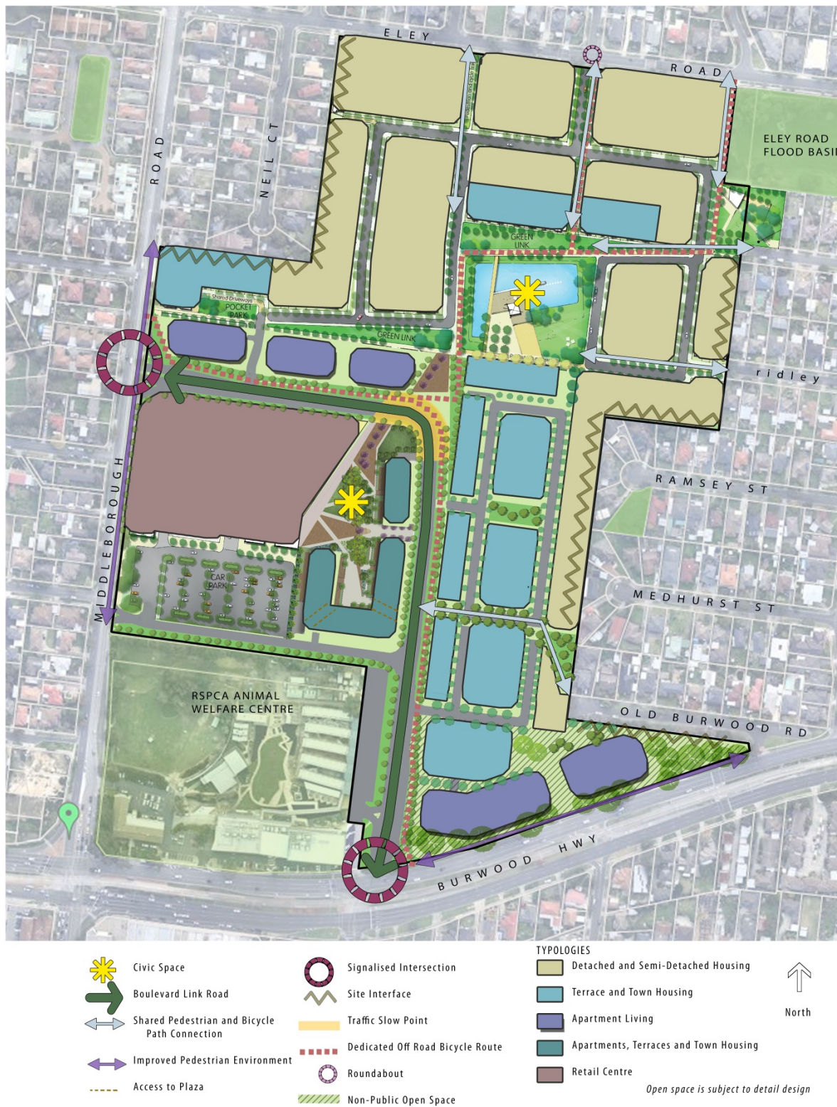
Figure 3 – Proposed Development Plan drawing, December 2015