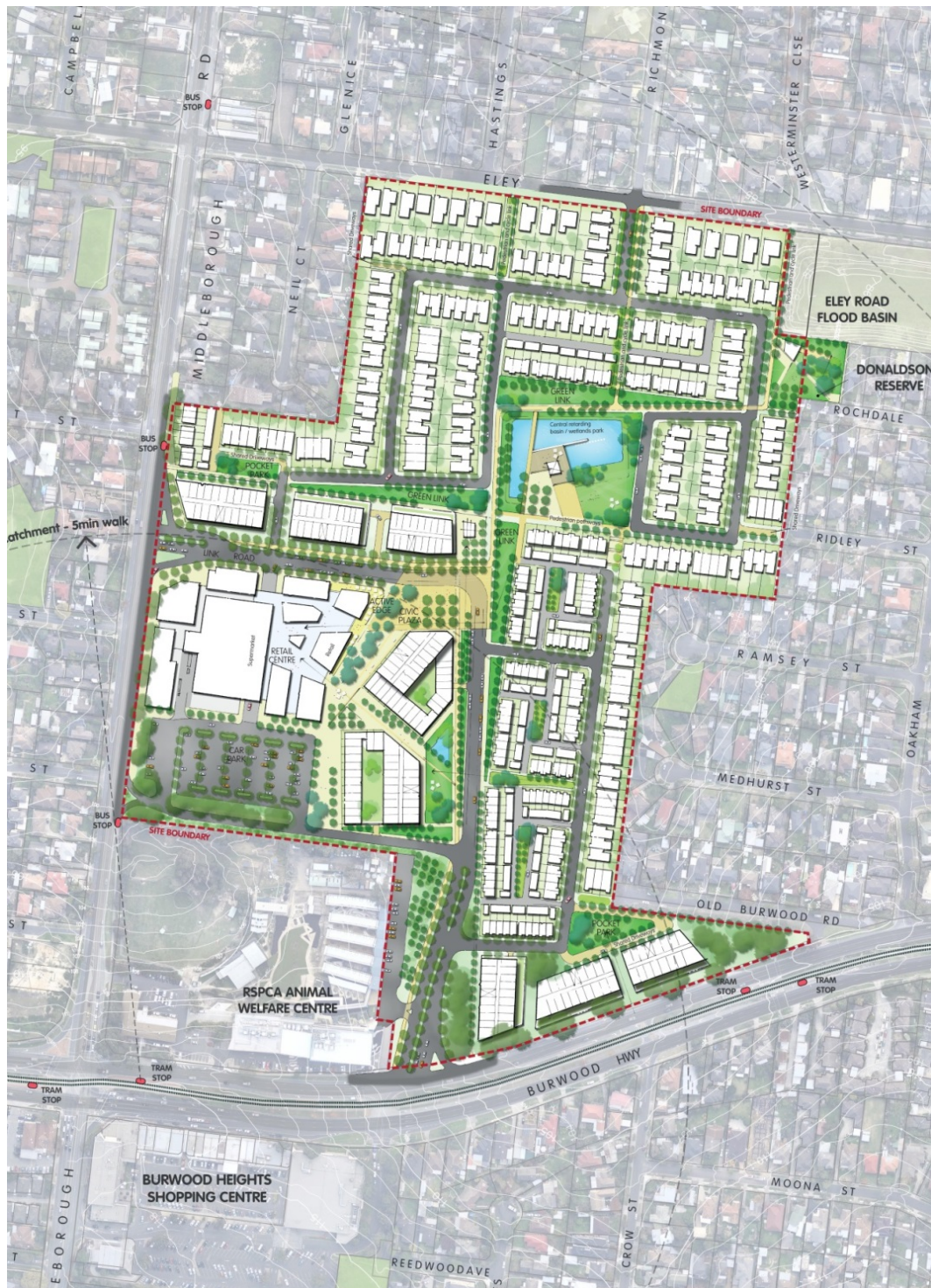
Figure 2 - Adopted Masterplan drawing, January 2015

Fraser's proposal for the 20.5 hectare site includes up to 950 dwellings for approximately 2,000 new residents, a shopping centre with 10,530 square metres of floor space, plus open spaces and public realm improvements. The key Masterplan drawing from the adopted Burwood East Master Plan and Urban Design Report, January 2015 (the Adopted Masterplan) is shown in Figure 2.