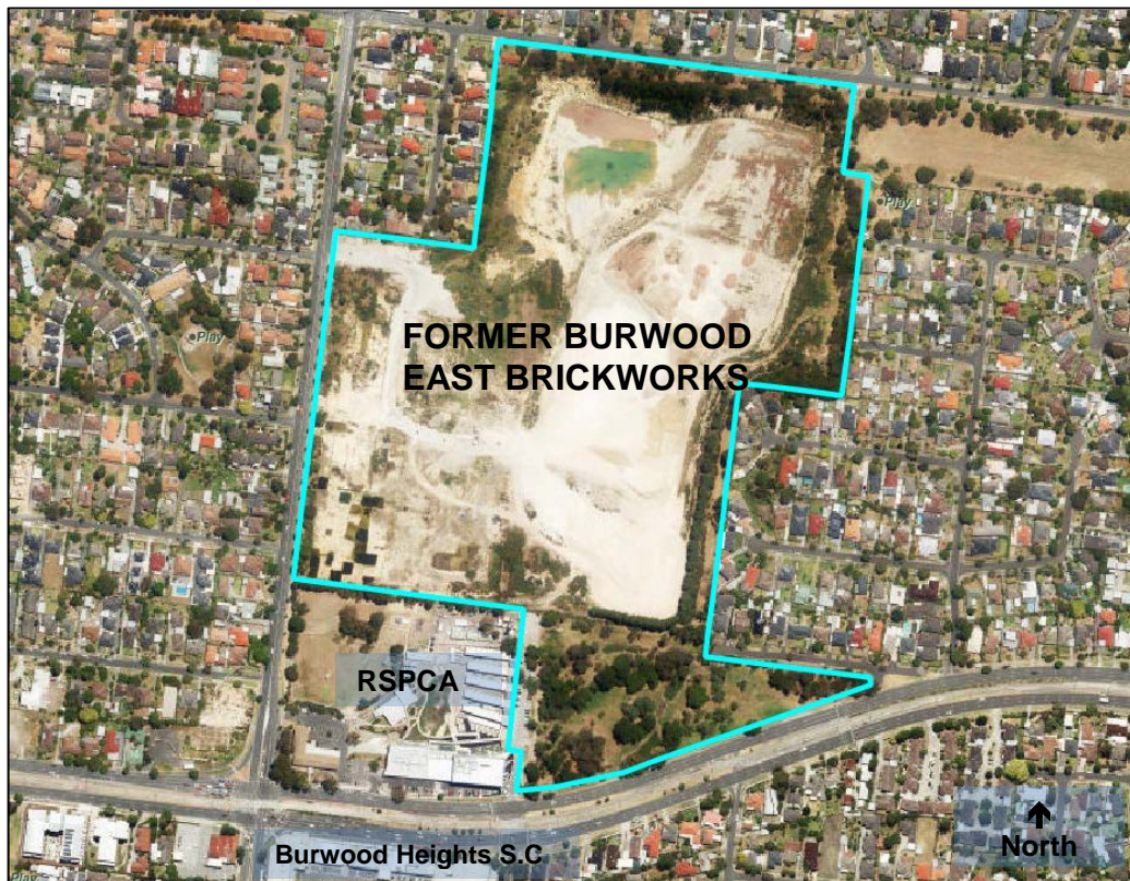
Figure 1 – Former Brickworks Site

In October / November 2014 Council consulted with the community on a proposed Masterplan and planning scheme amendment request for the former brickworks site at 78 Middleborough Road, Burwood East (refer Figure 1). Having considered the community feedback, at its meeting on 27 January 2015, Council resolved as follows: