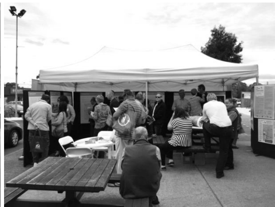
Burwood Heights Shopping Centre