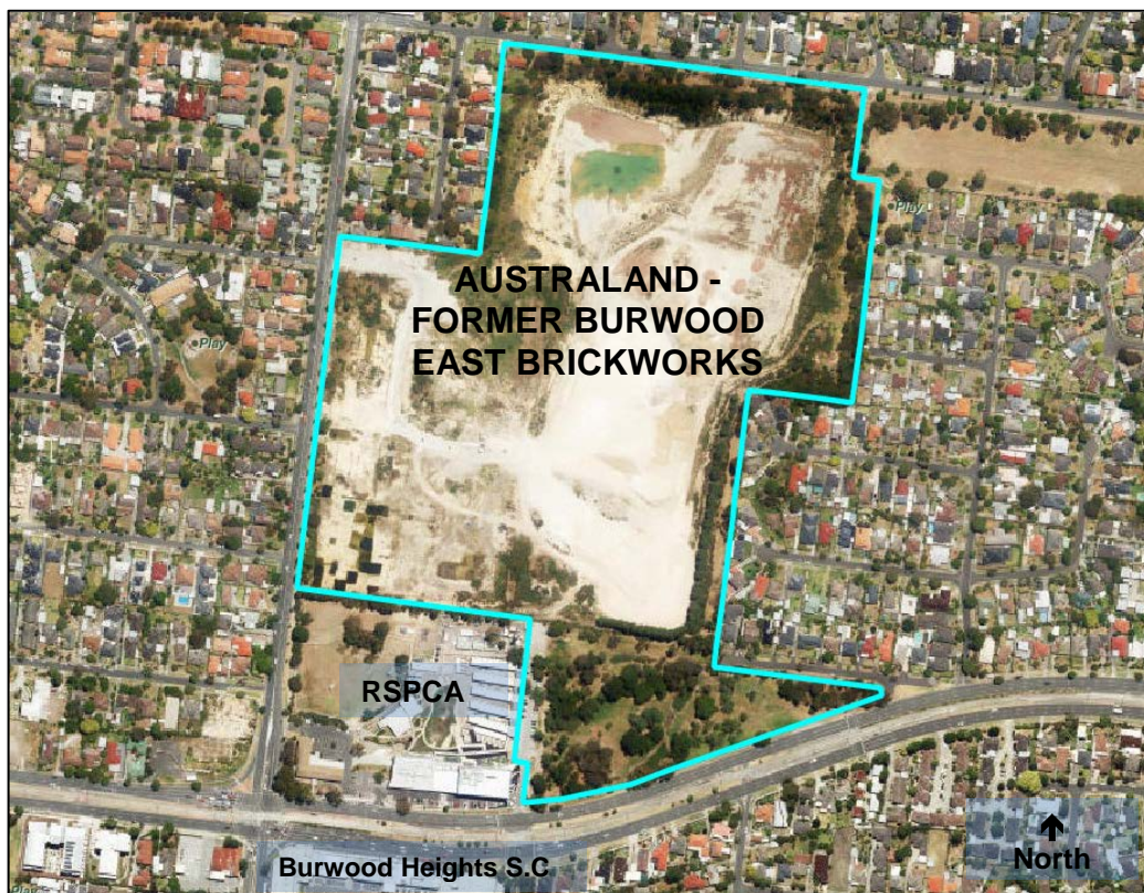
Figure 1 – Former Brickworks Site