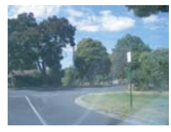
20 Melbourne Water pipe Reserve - East of Mitcham Rd