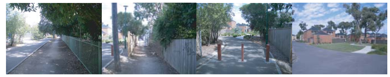
15 - 18 Views of route through housing development