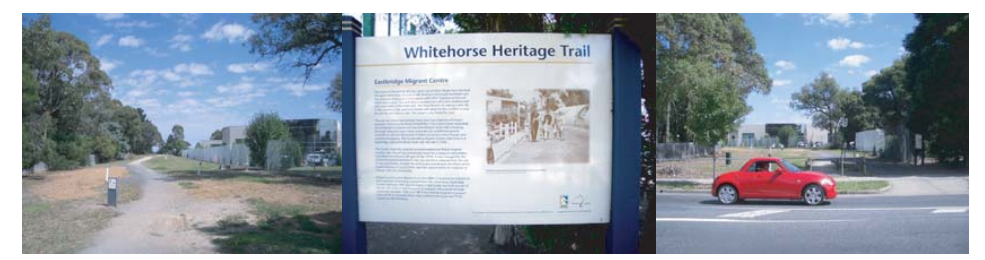
1 - 3 Views of Melbourne water pipe reserve - west of Rooks Rd

"Missing East: West link" Connecting bike/walking trails along Melbourne Water pipe reserve from Rooks Road to Mitcham Road Rooks and Mitcham Roads are busy major vehicular through routes and therefore not as suitable trail routes