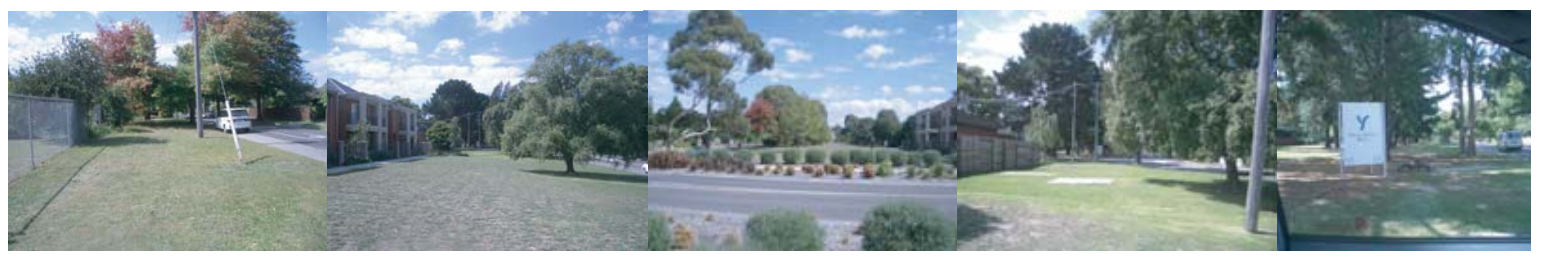
4 - 8 Views along Lucknow St reserve show adequate width for proposed trail