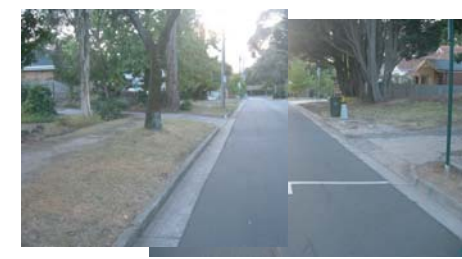
19 Agra St