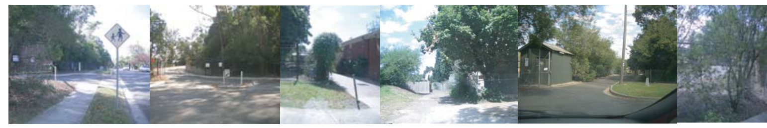
9 - 14 Views show Melbourne Water boundary fencing and entrance way