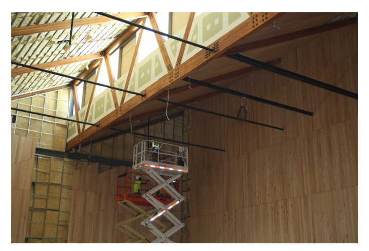
Installing large wooden panels in the stadium.

The extensive use of timber gives the stadium a rustic feel with large timber panels installed between the large exposed timber trusses and on the walls