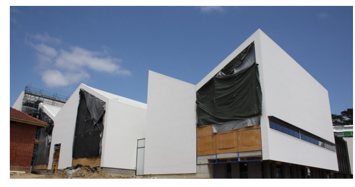
Large frittered glass will be installed on the east side.

With environmentally sustainable design a key feature of the building, 200 solar panels have been installed on the roof.