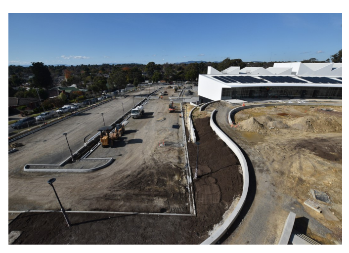
Aerial view of north perspective of site shows main car park, north west side of building and curved shape of dedicated outdoor recreation space.

With more than 20 community groups and Council's Meals on Wheels service operating under one roof, the hub will be the new vibrant heart of Nunawading. It will be a place where people of all ages and backgrounds feel welcome and can come together to embrace new opportunities for learning, social interaction and being active.