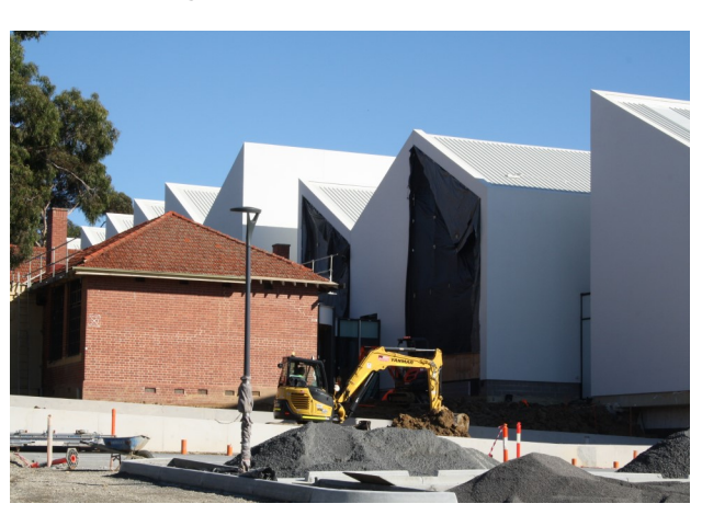
An excavator prepares the ground for paving around the building.

Construction of the outdoor recreation area, pathways and other hardscapes is progressing. A combination of advanced trees and shrubs will be planted throughout the site.