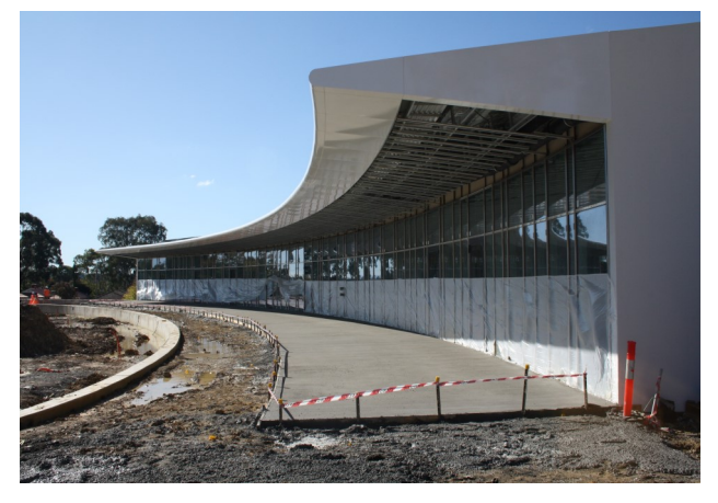
Extensive glazing will create light-filled internal spaces; however, ambient temperature will remain steady with all windows installed being double glazed.

The two studios open into one large space able to accommodate 200 people at a sit-down function or 500 people at a stand-up function.