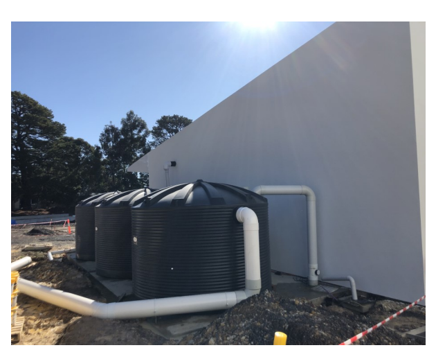
Three 25,000-litre tanks for rainwater harvesting near the entrance to the sports stadium.

With a 5-Star Green Star rating, the hub will be a leader in ecologically-sustainable design (ESD). Some of the ESD features include solar renewable energy for lighting and hot water heating, rainwater harvesting for toilet flushing, double insulation in the roof cavity, double-glazing, LED lighting, and use of natural and durable materials such as timbers and concrete with recycled content.