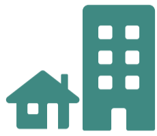
Changes to building heights

This means that planning rules will change in the area. There may also be more density of buildings in the area. Initial ideas for these changes are outlined in the State Government’s draft Precinct Vision which is now open for community feedback.