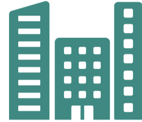
Changes to density of development