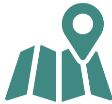
Location of housing and businesses