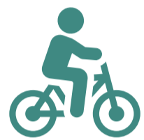
Changes to transport and public spaces