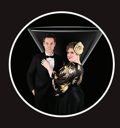
Shaken Not Stirred