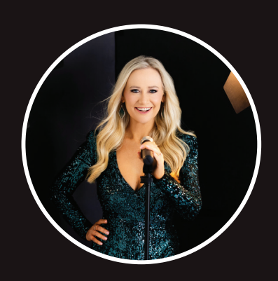
Broadway Baby -A Transformational Theatrical Experience