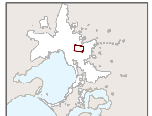
Part of Planning Scheme Map 6EAO

Disclaimer This publication may be of assistance to you but the State of Victoria and its employees do not guarantee that the publication is without flaw of any kind or is wholly appropriate for your particular purposes and therefore disclaims all liability for any error, loss or other consequence which may arise from you relying on any information in this publication.