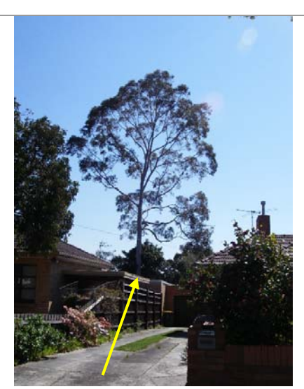
The Lemon-scented Gum