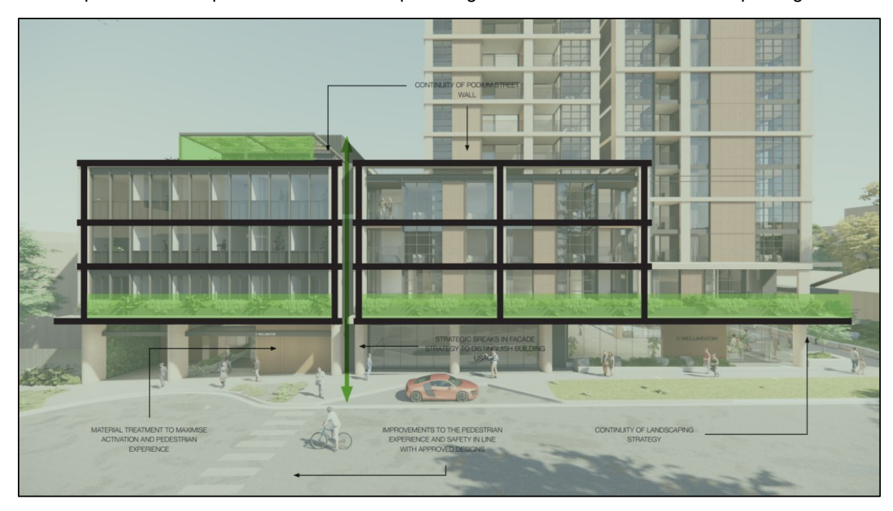
Figure 3: Uniformed presentation and podium response to Wellington Road