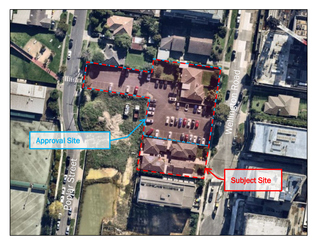
Figure 1: Location of Subject Site and existing Approval Site

The immediate and surrounding area of the Box Hill MAC has been subject to significant high-rise development and approvals over recent years in response to clear policy requirements and various services and amenities contained and aligned with the MAC status. The extent of construction/development approvals emerging and immediate to the Subject Site is demonstrated in Figure 2 below, with the expanded site area contributing towards this evolving context.